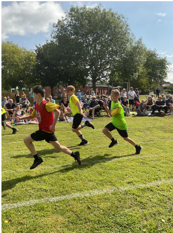
We had a lovely day at our sports day today, it was lovely to see all the families supporting their children and joining in with a picnic lunch. Here are just a few snaps of our races today.